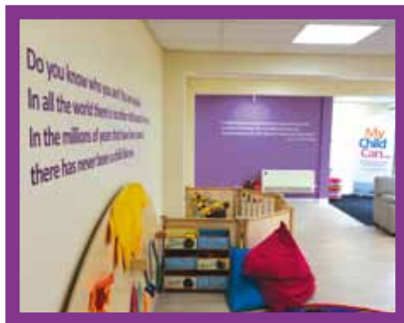
Above, newly refurbished Pensby Children's Centre; Below, Birkenhead Children's Centre's fresh new look.

Visit www.wirral.gov.uk to find the Children's Centres 'what's on' timetables of activities.